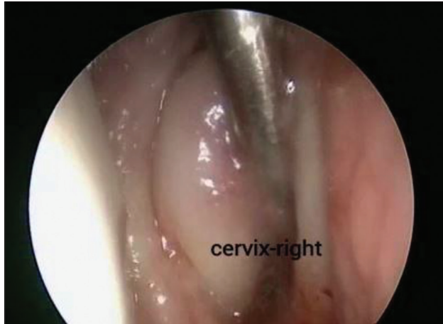
Figure 1: Cervix-right side