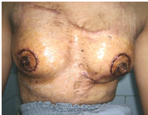
Figure 7: NAC reconstruction appearance at follow up

of 1.5 (mean) indicates more than satisfactory on patient's view of procedure outcome. Collective outcome in our study in early post-operative and later follow up has been satisfactory. (Figure 7)