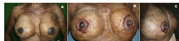
Figure 6: A) Skate flap marked over tattooed burned breast, B) Nipple projection in frontal view, C) Nipple projection in lateral view