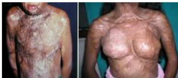
Figure 1: Post burns contracture of anterior chest wall with distortion of the breast and loss of NAC (Left); Appearance after breast reconstruction with well-formed breast mound (Right)

A total of 26 skate flap reconstructions were performed in 19 post burned breast patients included in the study.