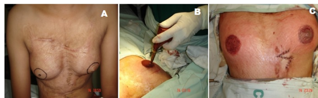
Figure 2: A) Desired NAC site marked with patient in sitting position, B) Tattooing, C) Immediately after tattooing

A total of 26 skate flap reconstructions were performed in 19 post burned breast patients included in the study.