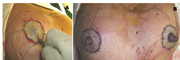
Figure 5: A) Full thickness skin graft applied around the nipple over the areola site, B) Final result per-operatively