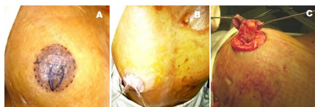
Figure 3: A) Skate flap marked, B) Raising subdermal flaps, C) Subcutaneous pedicled flap raised